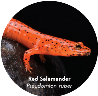
Red Salamander Pseudotriton ruber