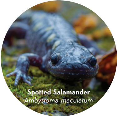
Spotted Salamander Ambystoma maculatum