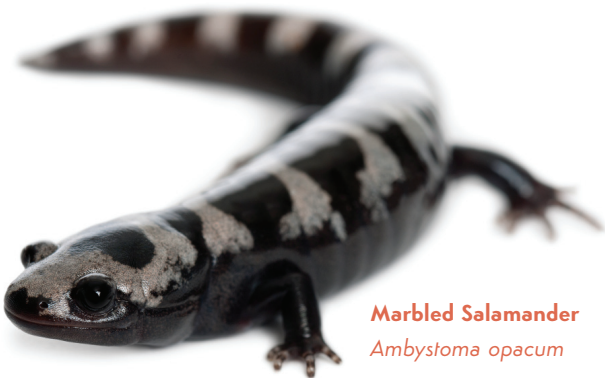
Marbled Salamander Ambystoma opacum

Salamanders have four toes on their front legs.