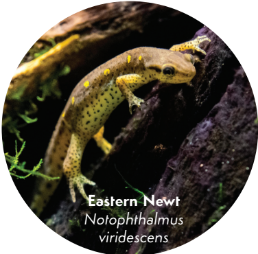
Eastern Newt Notophthalmus viridescens