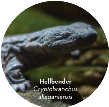
Hellbender Cryptobranchus alleganiensis